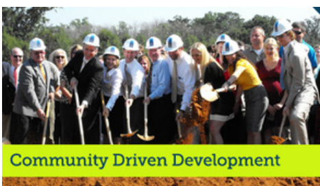
Community Driven Development