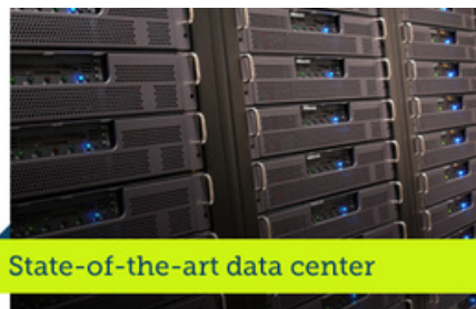
State-of-the-art data center