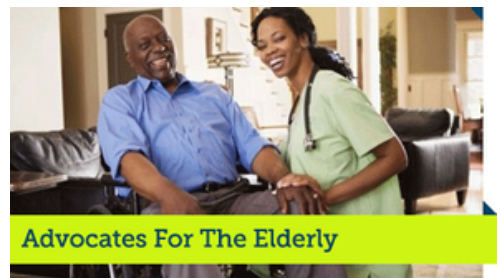
Advocates For The Elderly